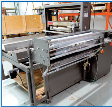
NENOTECH 5530 BAR SEALER