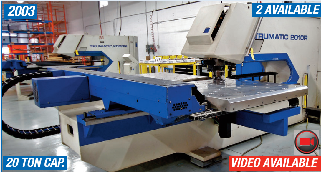
TRUMPF TRUMATIC 2010R CNC TURRET PUNCH