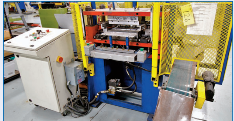
HYDRAULIC FORMING PRESS