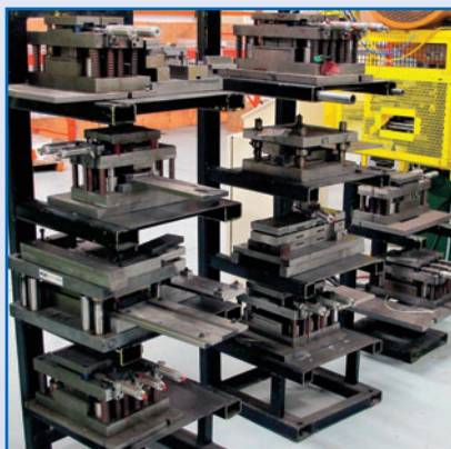
PARTIAL VIEW OF PRESS DIES