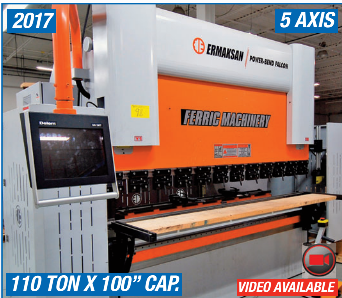
ERMAK POWER-BEND FALCON 8.53X110 CNC HYDRAULIC PRESS BRAKE