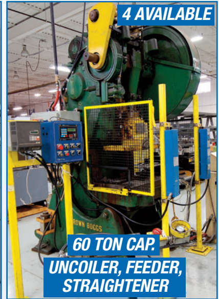
BROWN BOGGS PRESS LINE