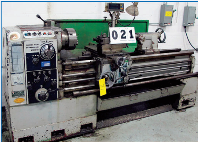
CHIEN YEH STRONG 1500 LATHE