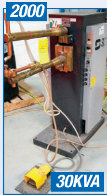
2000 SIP PP30 SPOT WELDER