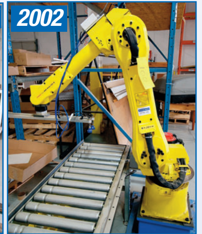
FANUC ARCIMATE 120UB 6-AXIS ROBOT