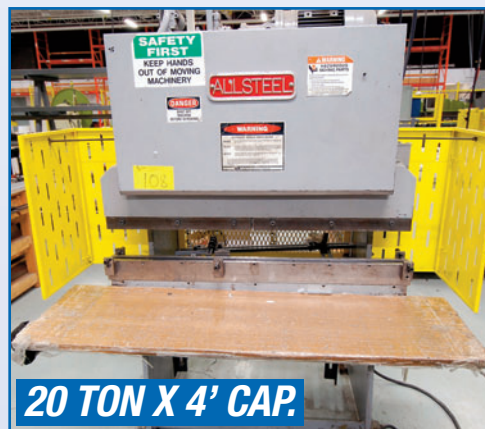
ALLSTEEL 20-4 HYDRAULIC PRESS BRAKE