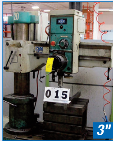
MAS V032 RADIAL DRILL