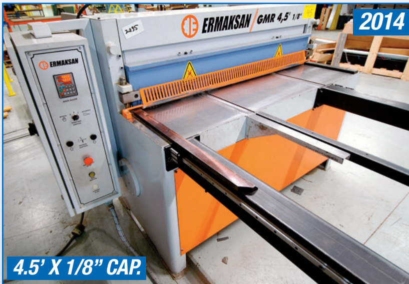
ERMAK GMR 4.5-1/8" SHEAR