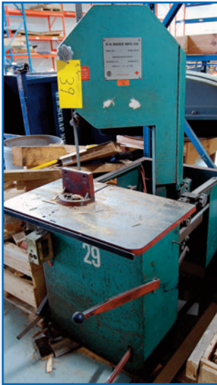
E-R MAIER KM1012 ROLL-IN BANDSAW