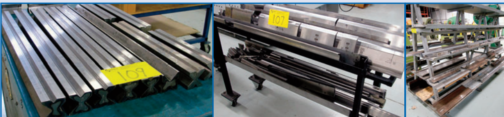
PARTIAL VIEW OF PRESS BRAKE DIES