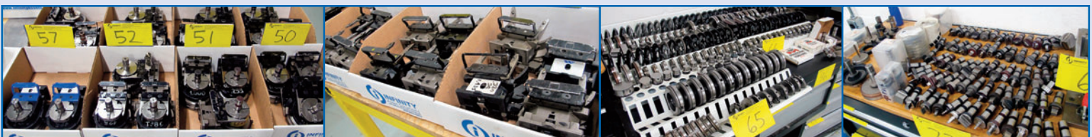
PARTIAL VIEW OF DIES AND TOOLING

TRUMPF Trumatic 2000R CNC Turret Punch, 20 Ton Capacity, Table Travel 100" x 50" with Repositioning, 9-Station Turret, CNC Control, s/n 9110/7000093 w/ Optional Brush Table (2) 2003 TRUMPF Multiset ITM Tool Presetters Qty. of Assorted Trumatic Tooling and Punching Heads