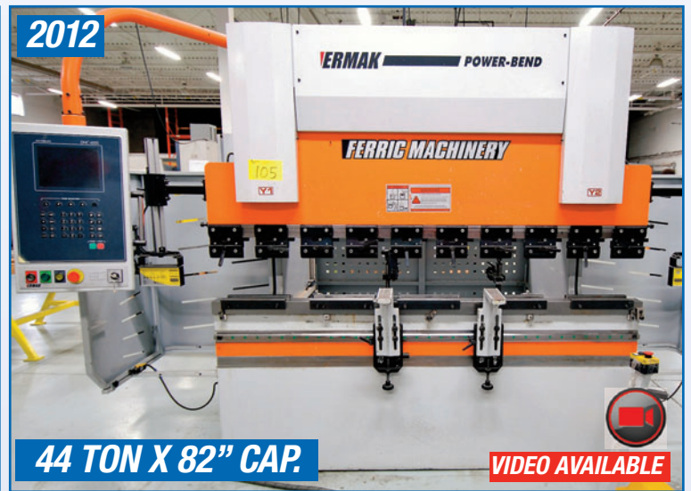
ERMAK POWER-BEND 7X44 CNC HYDRAULIC PRESS BRAKE