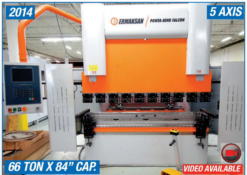
ERMAK POWER FALCON 7X66 CNC HYDRAULIC PRESS BRAKE