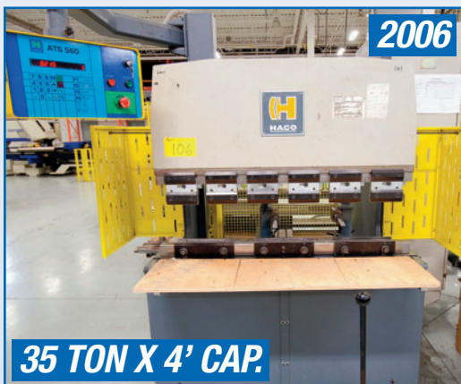
HACO PPEC HYDRAULIC PRESS BRAKE