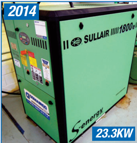
SULLAIR 1809E AC AIR COMPRESSOR