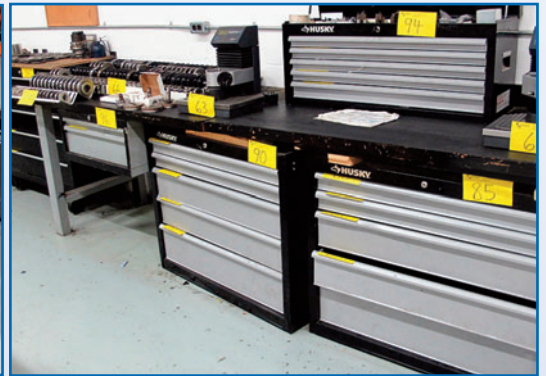
HUSKY MULTI DRAWER TOOL CABINETS