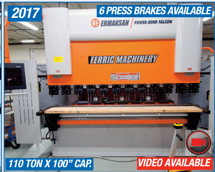
ERMAK POWER-BEND FALCON 8.53X110 5-AXIS CNC HYDRAULIC PRESS BRAKE