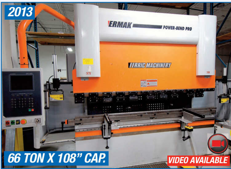
ERMAK POWER-BEND PRO 8.5X66 CNC HYDRAULIC PRESS BRAKE