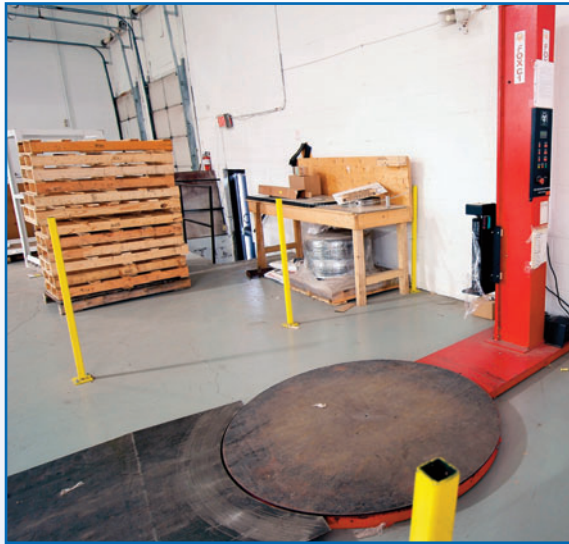
FOX C1 PALLET WRAPPER