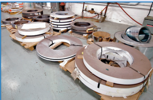
PARTIAL VIEW OF COIL INVENTORY