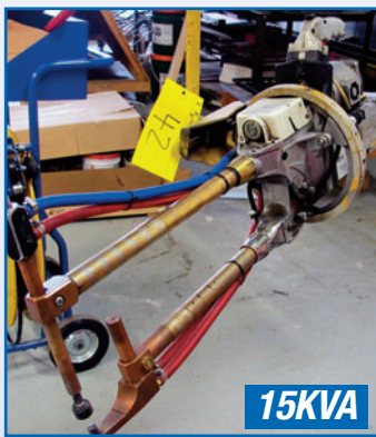
ARO TECNA S2151 PORTABLE SPOT WELDER

2000 SIP PP30 Spot Welder, 30KVA s/n 507226 ARO TECNA S2151 Portable Spot Welder, 15KVA, s/n 507222 2002 FANUC Arcmate 120iB 6-Axis Robot c/w Fanuc System R-J3iB Controller MAS V032 Radial Drill, 3' Arm, s/n 739 w/ Box Table E-R MAIER K 1012 Roll-In Bandsaw NENOTECH 5530 Bar Sealer c/w Front & Side Bar Sealer, 24" Belt Feed, s/n 20030801 FOX C1 Pallet Wrapper, s/n C1-112309207 LINCOLN ELECTRIC AC-225 Welder M1 Platform Scale w/DRO DUSTKOP Dust Collector CINCINNATI Dual Pedestal Grinder, 1/2 HP (4) HUSKY Multi Drawer Tool Cabinets c/w Wood Work Surface (2) Sections Pallet Racking (3) 5,500 LB Pallet Jacks Dewalt Chop Saw, Ridgid Shop Vac, Ridgid Portable Table Saw, Steel Banding Cart, Tooling Vises, Benches, Cabinets, Lifting Tables, Power & Hand Tools, Workbenches, Toolboxes and Much More!